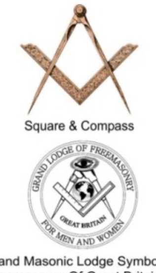
Grand Masonic Lodge Symbol Freemasonry Of Great Britain

The story is littered with these Knights Templar / Masonic conspiracy "clues" because that is the nature of the story. It is alluding to modern conspiracy lore and playing to the beliefs of conspiracy culture.